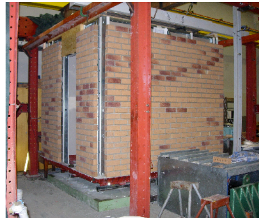
(b) Completed Test specimen